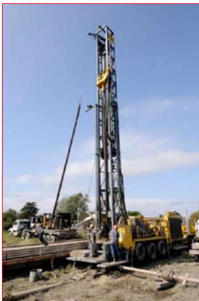
The secret to tripping pipe.

L&S operates a new Atlas Copco RD20 drill rig, equipped with a 1250 cfm 350 psi air compressor (1250 cubic ft of free air delivery at 350 pounds/in. 2 ). Once drilling into water, the head pressure begins to build. To evacuate excess water, the company’s driller, Dustin Hirrlinger, engages the auxiliary booster; however, he admits that “I usually crank up booster early because I can drill faster.” L&S runs a two-stage Atlas Copco Hurricane booster, although it is possible to