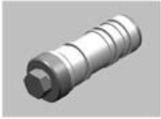
PowerAdapt (overload protection)