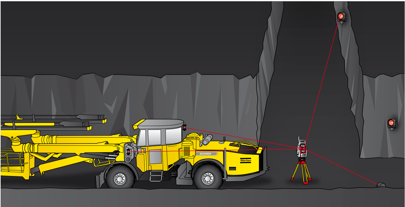
Communication between the Rig Control System, the Total Station, prisms mounted on fixpoints and prisms mounted on rig.