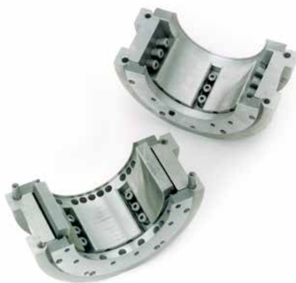
A horizontally-split bearing

When the findings suggest corrective measures are needed, we will gladly work with you to plan repairs, order parts, schedule maintenance, or implement other required responses.