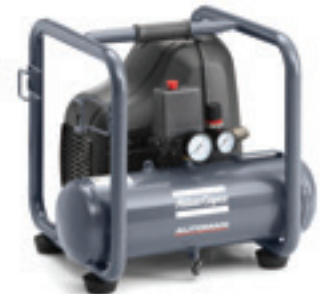
AH 20 E 6