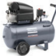
AF 25 E 50