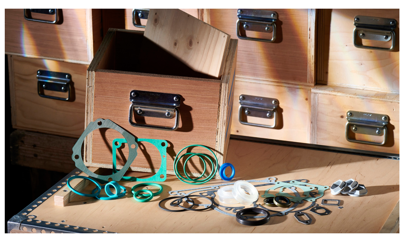
NA = Not available