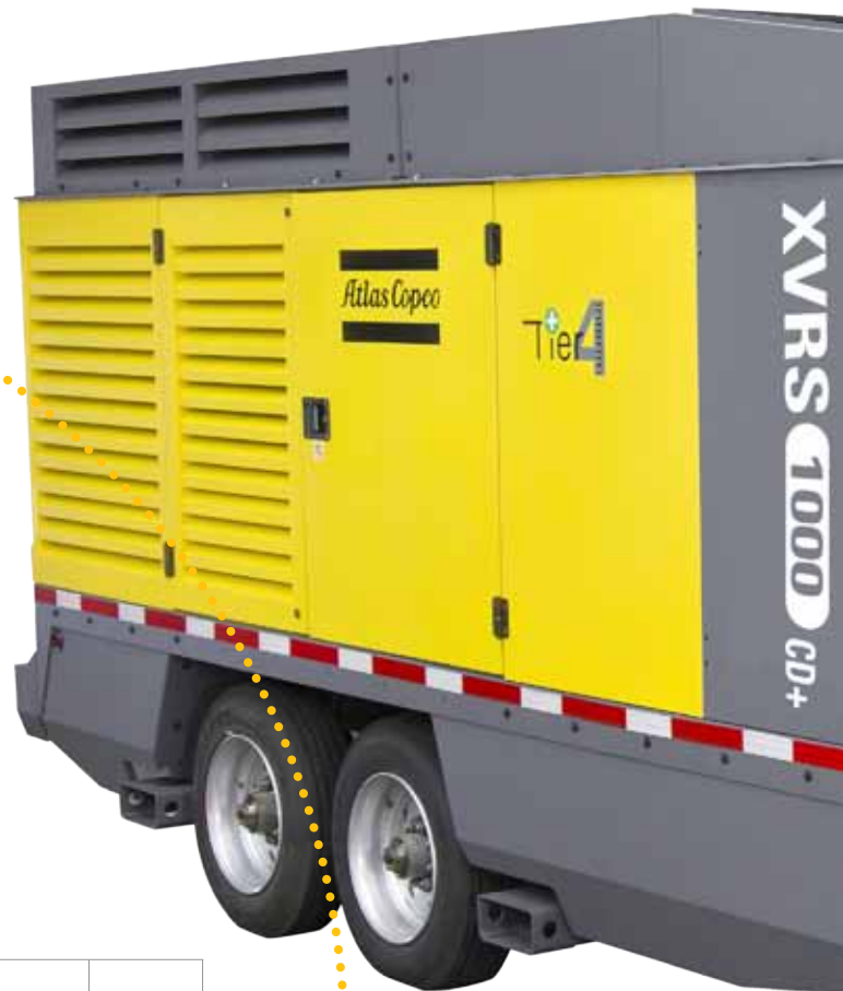
Variable Flow and Pressure (Operating range)

The variable pressure and flow of the DrillAirXpert™ system makes these compressors adaptable to a wide range of applications. Any job can now have its flow or pressure requirements dialed in with exact certainty.