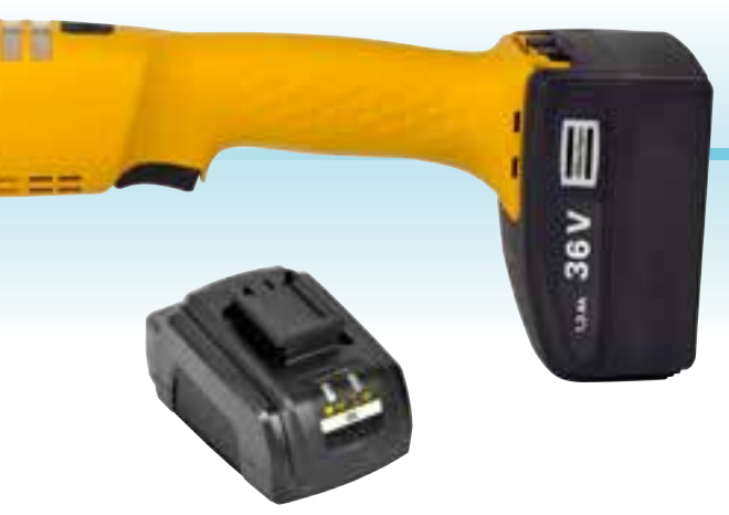
Multicharger (Fits all Atlas Copco batteries)

With BCP and BCV tools there are no cables or hoses, and the battery pack can be mounted on the tool in two directions for optimum accessibility.