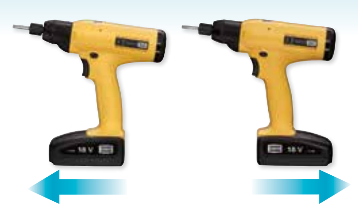
Optimum accessibility with variable battery position.