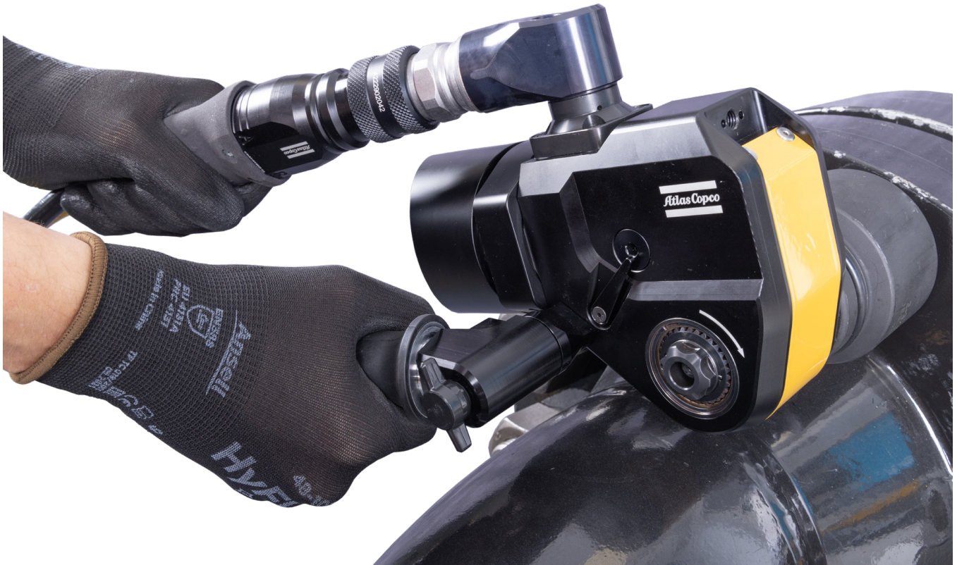
The new 'TorcFlex' range of hydraulic wrenches incorporate various safety features designed to prevent dropping hazards and ensure safe operation. The single co-axial hose coupling promotes ease of use and can reduce tripping hazards

positive impact when used with hydraulic wrenches or electric and battery tools.