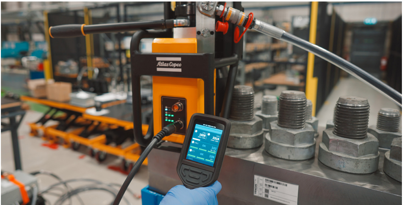
The Smart Tensioning System has a hand controller to guide the operator, which speeds up the process, reduces the risk of errors whilst always securing safe operation

be a problem if dropped from a great height. To address this, the Atlas Copco TorcFlex range of Hydraulic wrenches have adopted some new solutions to reduce this risk. A 'retained reaction bar', allows the position of the reaction bar to be moved on the tool, without the bar itself ever being removed from the tool.