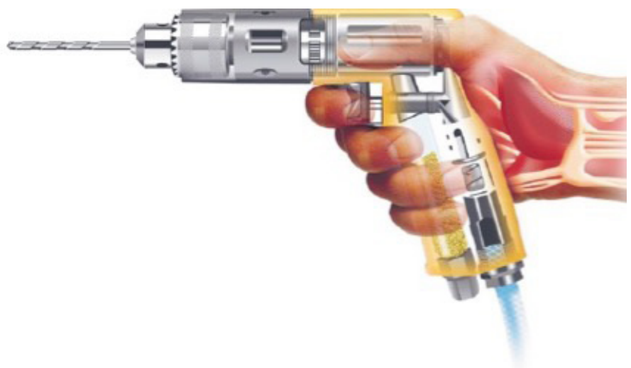
Good handle design ensures the best result with minimum strain on the operator, with a focus on the integration of tool and human as one

Falling items inside a wind turbine can result in great damage. Even a small component will