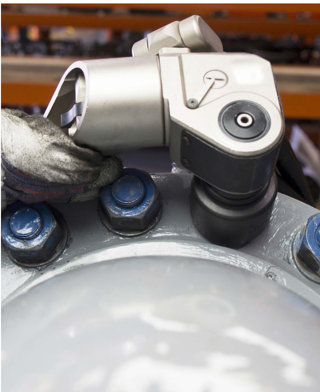
A typical scenario where fingers can be trapped and damaged as the user moves the tool

This is a very simple and extremely cost-effective solution, which can have a very