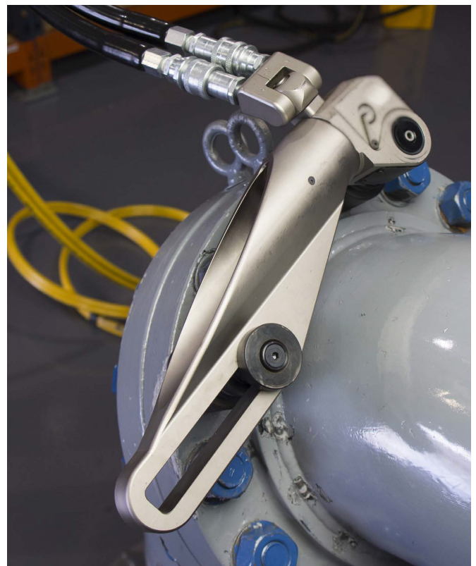
A sliding drive reaction bar with a socket on an adjacent nut with no risk of finger or hand injury