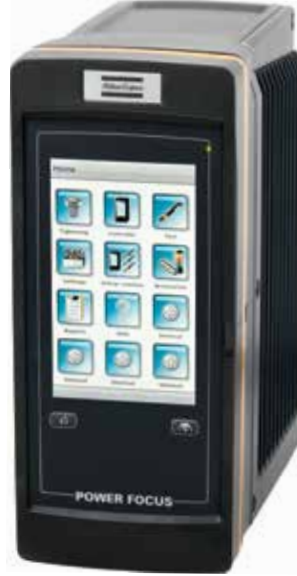
Power Focus 6000

Intelligence in the palm of your hand. Software, tightening data and configuration – carry all important information with you in a future proof portable module. Easy to upgrade and stable with a rapid back-up function. Two software areas allow for smart software management. Allowing a much safer upgrade process, always giving the possibility to switch between two software versions.