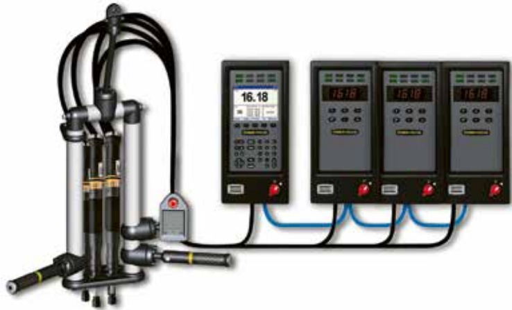
Tensor spindles are easily fixtured using our standard range of Express mechanics. The control strategies StepSync and SynchroTork synchronize Tensor spindles to provide consistent clamp forces over the entire component mating face.

Worldwide communication is a matter of giving access through a factory network gateway to Power Focus.