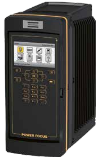
Power Focus 600

Both hardware and software is intuitive, giving clear operator feedback on the screen.