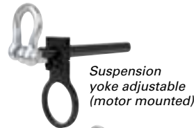
Suspension yoke adjustable (motor mounted)