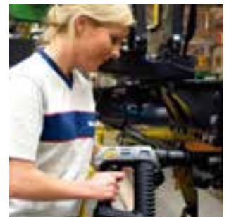
Chassis and axle assembly.