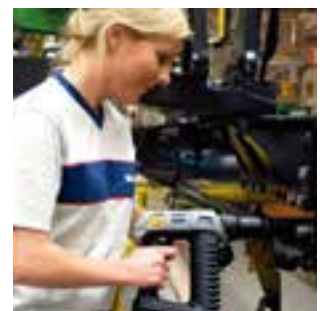
Chassis and axle assembly.