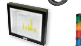
MaxiDisplay 3 (19")