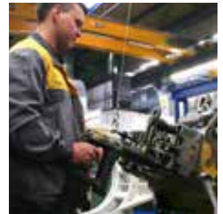
Cylinder head assembly.

Read more at www.atlascopco.com/tensorrevo