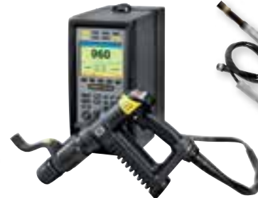
Power Focus 4000 Graph