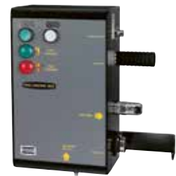
Tool Control Box (TCB)