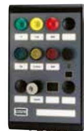
Operator panel Basic