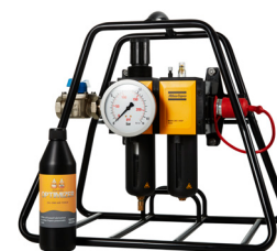
Productivity kit FRL