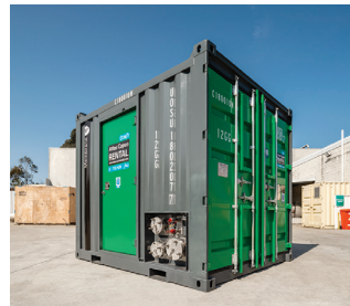
High Capacity Nitrogen Generators

Our fleet includes nitrogen generators designed for offshore use. These generators are enclosed in 10 or 20-foot containers that carry DNV 2.7-1 certification for easy mobility onto ships and platforms, and have a host of safety features to ensure maximum protection during offshore work.