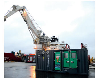
Offshore-compliant Nitrogen Generators