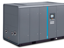
Oil Free Rotary Screw/Tooth