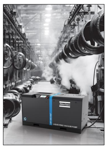
Ideally suited to wet, humid and dirty applications, the LRP VSD<sup>+</sup> is a state-of-the-art vacuum solution with unrivalled innovation and integration capabilities.